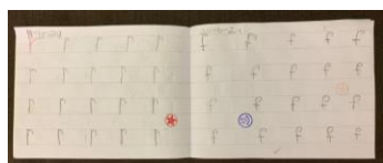
Suliman Room 16 Handwriting