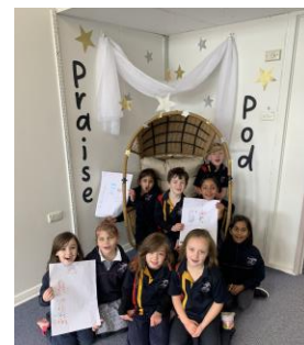
Room 21 learners sharing Initialit learning