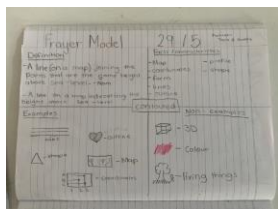
Yesha Room 5 Vocabulary

The teaching and learning that occurs at Karrendi everyday is outstanding. I would like to take this opportunity to acknowledge our incredible teachers for embracing new practices this year- from implementing daily reviews to beginning our journey in Spell Ex, trialing engagement norms, explicitly teaching handwriting, and setting high expectations for 5-Star Work- Karrendi teachers always go above and beyond to ensure our students are receiving the best education they can. This has resulted in incredible growth across the school. Take a look below at some high-quality work shared at last week's assembly for our Look at that Book award. We have also had lots of visitors to the Praise Pod to share their learning. I can't wait to see what our teachers and learners achieve next term! I hope everyone has a wonderful break!